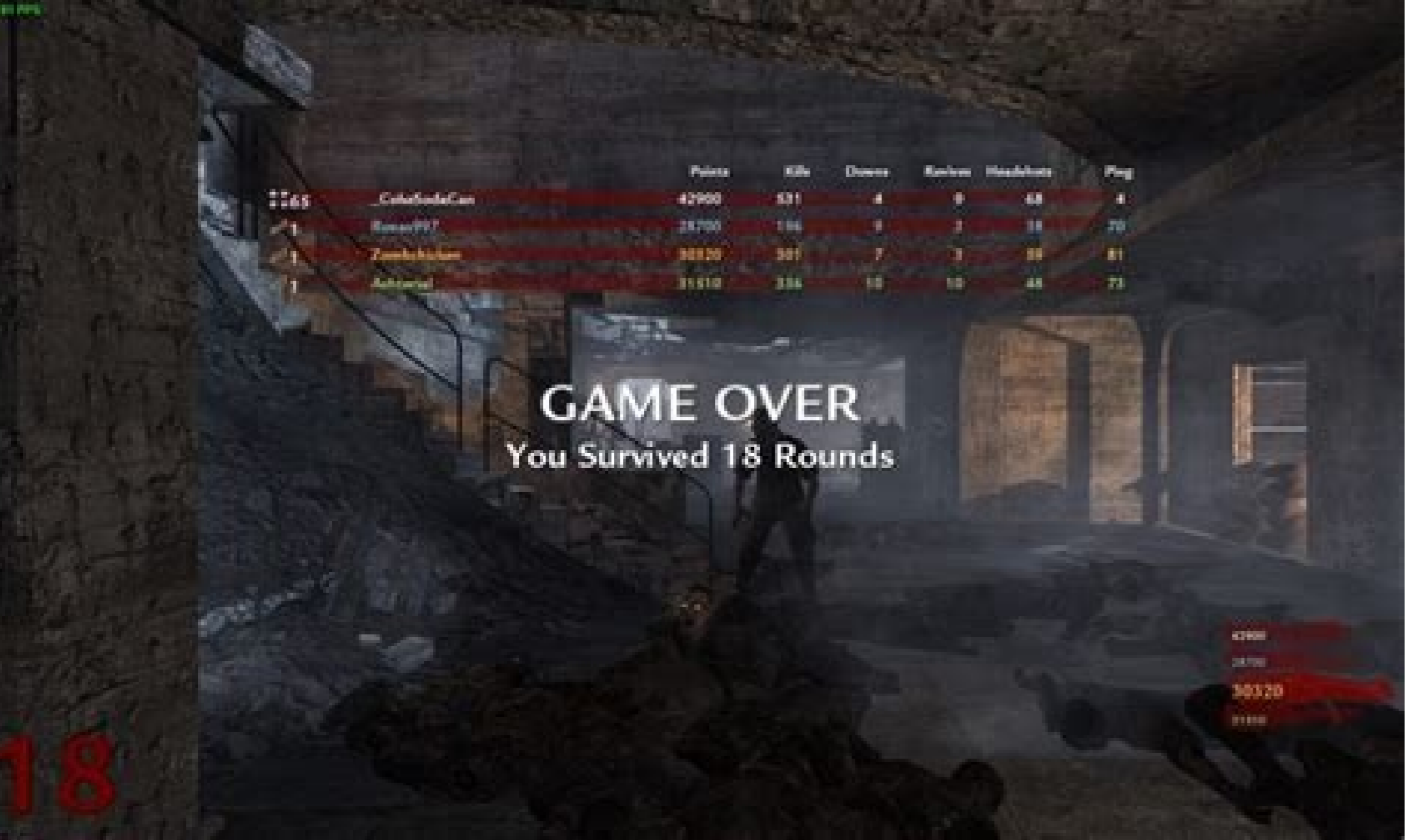
Play steam on android tablet. Play steam on android phone. Playing steam games on android tablet. How to play steam games on android without pc. Can steam games be played on android. Playing steam on android. Can i play steam on android. Play steam on android tv.